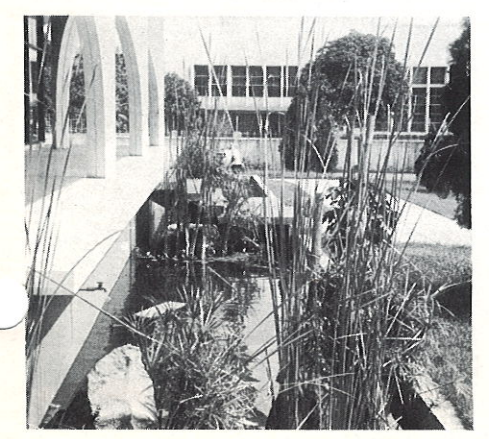
Exotic entrance to new offices

Even though there are several new buildings in this district, only one had (Continued on Page 4)