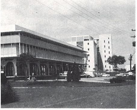
Radio Church of God Offices occupy the corner of the CCC Building