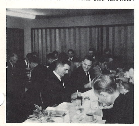
Joint meeting of Corpus Christi and San Antonio Spokesman Club

Several things have happened in the Corpus Christi and San Antonio Spokesman Clubs this month. It seems we are always doing something to have more fellowship with one another and we are very happy to be able to have this close association with one another.