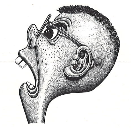
WINN . . . Wad'da ya mean I LOST!?

man Club started the afternoon full of confidence and we had it crushed out of us before the evening was over. What happened? We were hit by a run-away express in the form of the San Antonio Spokesman Club softball team. Yes, we were crushed on the battlefield of the softball diamond. What turned these "patsies" into such tigers? I am